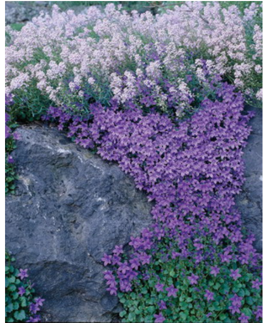
English Rock Garden

Not all alpines make the transition to lower elevations easily – a good many are a challenge to grow, requiring specialized sites or alpine greenhouses, but not Rock Stars®. We think most gardeners should enjoy success with these little guys with a minimum of fuss. Some Rock Stars® even thrive on neglect under the brownest of thumbs. They may be small, but they're tough and resilient!